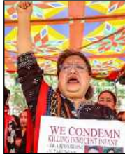
Monday seen blocking roads and checking vehicles as part of the agitation.

New Delhi, Apr 21: Protests continued in parts of Manipur on Tuesday over the Tronglaobi bomb attack, with demonstrators demanding justice for two minor siblings killed in the April 7 strike in Moirang's Tronglaobi Awang Leikai area. The unrest has now widened beyond one protest site, with the Meira Paibi Lup's five-day shutdown affecting normal life across several districts. Roads, markets, shops and business establishments remained shut in many areas, while commercial vehicles largely stayed off the roads. Protests continue as shutdown disrupts daily life.