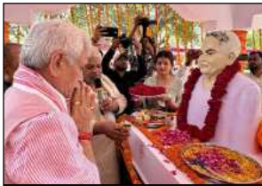
and the founder of Mahamadaleshwar Shri Bal Krishna Yati Inter College at Ghazipur, Uttar Pradesh. Paying homage to