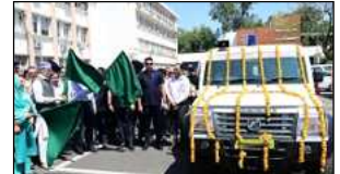
JKSPDC has provided 07 TruNat machines at a cost of ₹58.80 lakh and 02 hand held X-ray machines costing ₹35.96 lakh. For the Thalassemia Day Care Centre at SMGS Hospital,

JAMMU, APRIL 21: Chief Minister Omar Abdullah today flagged off seven ambulances and other healthcare equipment from Civil Secretariat, Jammu for multiple districts across Jammu and Kashmir, provided by Jammu and Kashmir State Power Development Corporation under its Corporate Social Responsibility (CSR) initiative. The ambulances have been distributed across Jammu and Kashmir at a total cost of ₹144.73 lakh. In addition,