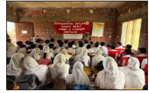
importance of education, counselling and community support in preventing drug abuse. The interactive session encouraged critical thinking and open dialogue, making the debate both informative and impactful. The initiative, in support of the Nasha Mukti Abhiyan, proved highly effective in spreading awareness and reinforcing the message of a drug-free lifestyle. It also motivated students to act as ambassadors of change within their communities, contributing to the larger goal of a healthier and safer society. The program concluded with motivating remarks, emphasizing the importance of staying away from drugs and actively supporting the vision of a drug-free Jammu and Kashmir.

The Indian Army organized a drug awareness debate today at Harni as part of its ongoing efforts to combat drug abuse and promote a culture of healthy, disciplined and responsible living among the youth. The initiative aimed to sensitize students to the growing threat of drug abuse and encourage them to adopt a drug-free lifestyle. The debate, held at Harni, witnessed active and enthusiastic participation from 45 students, who presented their views on the issue of drug abuse. The students displayed remarkable confidence and awareness, addressing issues such as the harmful effects of drugs on health, the breakdown of families, the rise in crime, and the