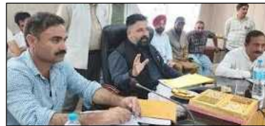
Commissioner Panchayat (ACP), Poonch Executive Engineers of various development departments, Divisional Forest Officer (DFO), Poonch Other district officers. During the session, the Hon'ble MLA reviewed the progress achieved during the last financial year and commended all departments for their diligent work and timely completion of projects. All departments were instructed to work with compassion, dedication and hard work. Officers were urged