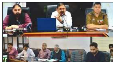
feedback system regarding drug peddlers to ensure timely and effective action. He stressed the importance of public participation in awareness rallies and urged officers to motivate citizens to actively join such initiatives so that awareness about the harmful effects of drugs reaches every sector of society. The Senior Superintendent of Police assured that the police department is actively working to curb drug abuse and that strict action will be taken against offenders. The Drug Inspector presented a detailed report on enforcement actions taken, while the Forest Department