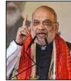
was not merely about choosing a government but about "freeing Bengal from infiltrators, corruption and fear". "Mamata Didi wants to protect infiltrators. But I am telling you, press the button on EVM before the lotus (BJP's poll symbol) on April 23 and a BJP government will drive out

SALBONI (WB), APR 21: Union Home Minister Amit Shah on Tuesday alleged that Chief Minister Mamata Banerjee was shielding "infiltrators", promoting dynastic politics and backing attempts to raise a "Babri Masjid-modelled mosque" in West Bengal, which the BJP would not allow. Addressing a rally at Salboni in Paschim Medinipur ahead of the first phase of the West Bengal assembly polls, Shah sought to turn the contest into a direct ideological battle between the BJP and the ruling Trinamool Congress. He declared that the election